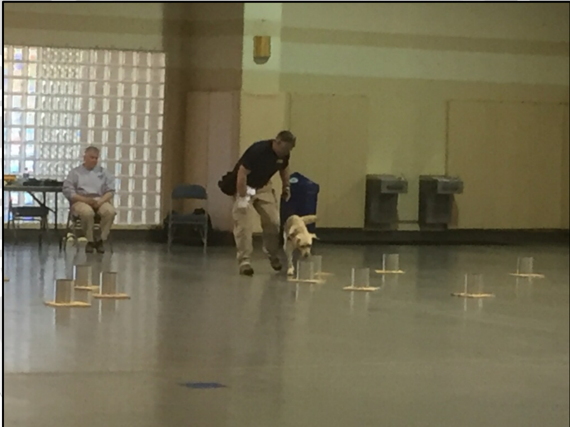
An accelerant detection canine handler bringing his canine through a testing course.