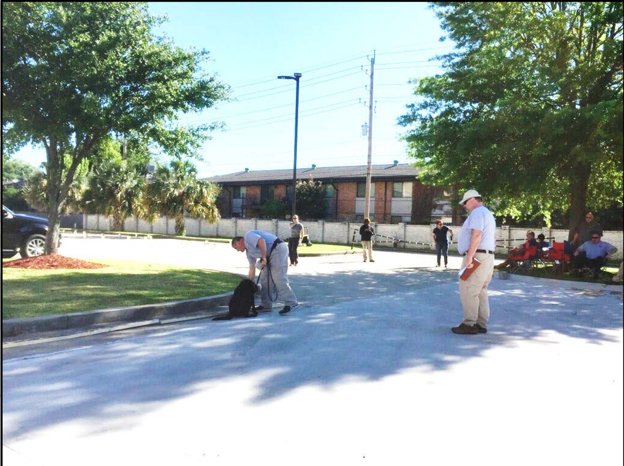
An accelerant detection canine handler bringing his canine through an outside testing course.