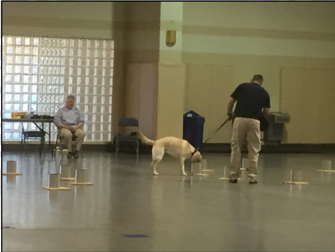
An accelerant detection canine handler watching his canine examine a can.